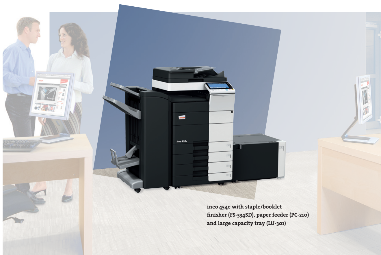
ineo 454e with staple/booklet finisher (FS-534SD), paper feeder (PC-210) and large capacity tray (LU-301)

These black-and-white systems come with a number of energy-saving features that cut power consumption by over 40% compared to predecessor models. While this kind of economy saves money, other green features are ecologically beneficial. And that means DEVELOP's ineo e line-up is not only good for the environment but also boosts the owner's green credentials.