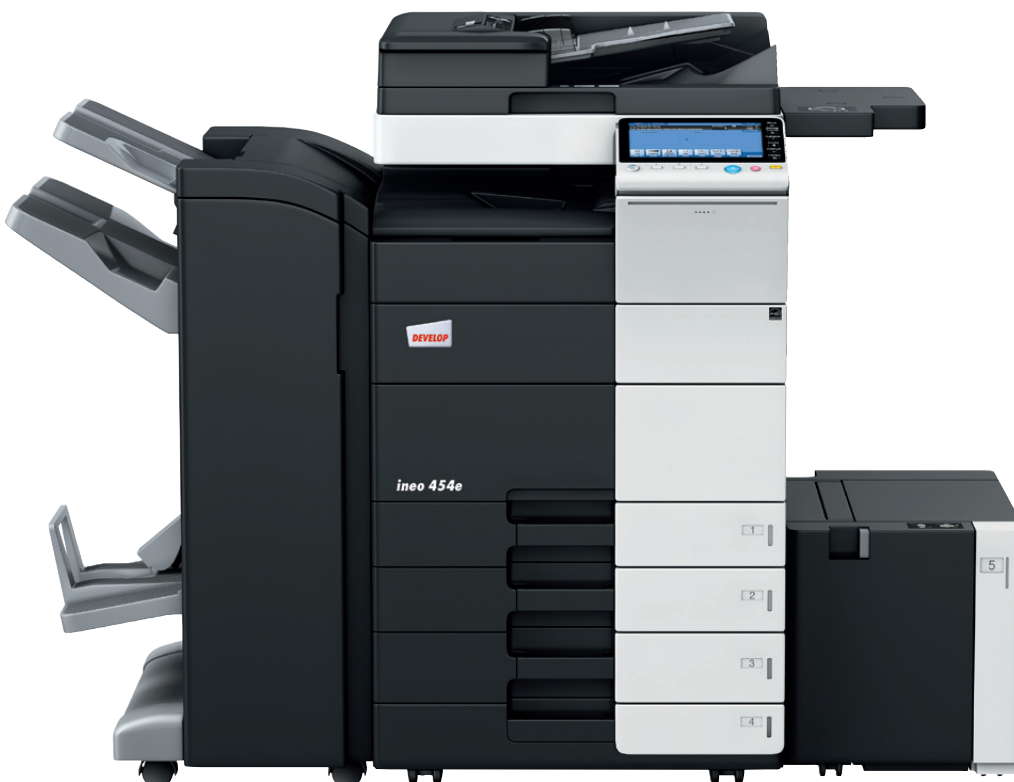
ineo 454e with staple/booklet finisher (FS-534SD), paper feeder (PC-210), large capacity tray (LU-301) and working table (WT-506)

Each of these multifunctional office devices – the ineo 224e, ineo 284e, the ineo 364e, the ineo 454e and the ineo 554e – is not only remarkably easy to use but also offers a wide variety of features to facilitate everyday office tasks. By saving office users time in printing, copying or scanning, they can return to their normal work faster. And that will ultimately help boost productivity.