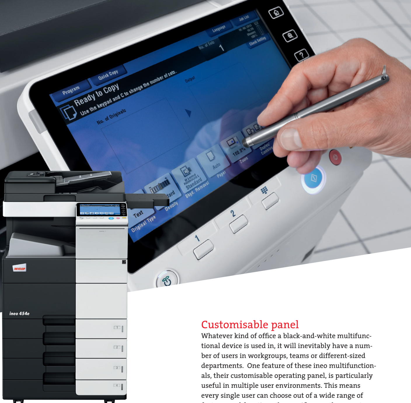
ineo 454e with paper feeder (PC-210), working table (WT-506) and output tray (OT-506)