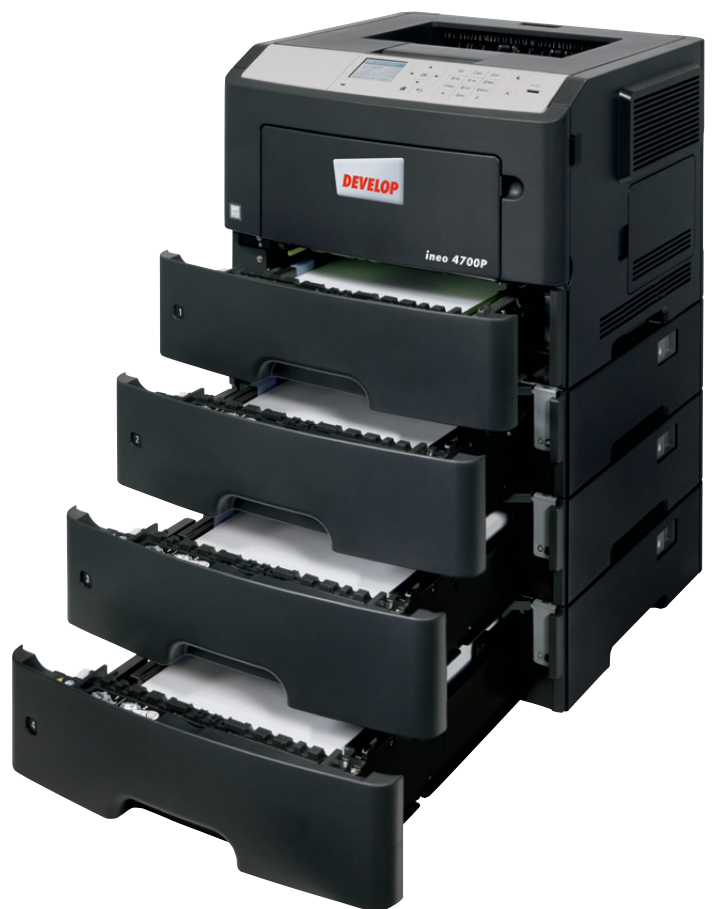
ineo 4700P with three additional paper cassettes (PF-P12)

If the operating system on your current printer is frustratingly difficult to follow and the device difficult to use, it's time you considered switching to an ineo 4700P. Its 2.4-inch colour display ensures intuitive operatability and highlighted menus show users the system's status, operating options and settings. What's more, a folder-like navigation concept means the ineo 4700P is easier to use than many older systems. This saves your staff time and effort in everyday printing jobs. And nobody will have to consult an operating manual before using this new printer.