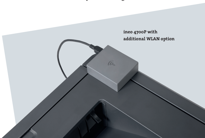
ineo 4700P with additional WLAN option