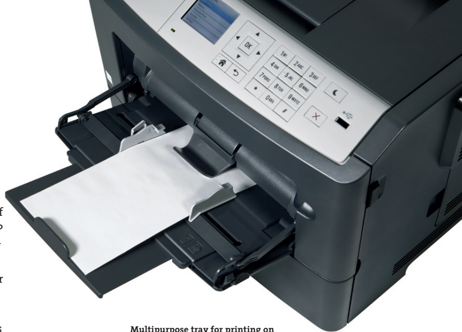
Multipurpose tray for printing on special media such as envelopes

Are high-volume print jobs commonplace in your business? With a maximum capacity of 2,300 sheets you can be sure that the ineo 4700P will not run out of paper. And if you frequently print on different kinds of paper, e.g. with or without your corporate logo, you can have your ineo 4700P equipped with up to three paper trays (with 250 or 550 sheets). If the trays are stocked with different kinds, sizes and weights of paper (A6–A4 and 60–163 g/m 2 ), you ensure your staff to waste no time switching from one kind of paper to another, or running back to a printer that has run out of paper.